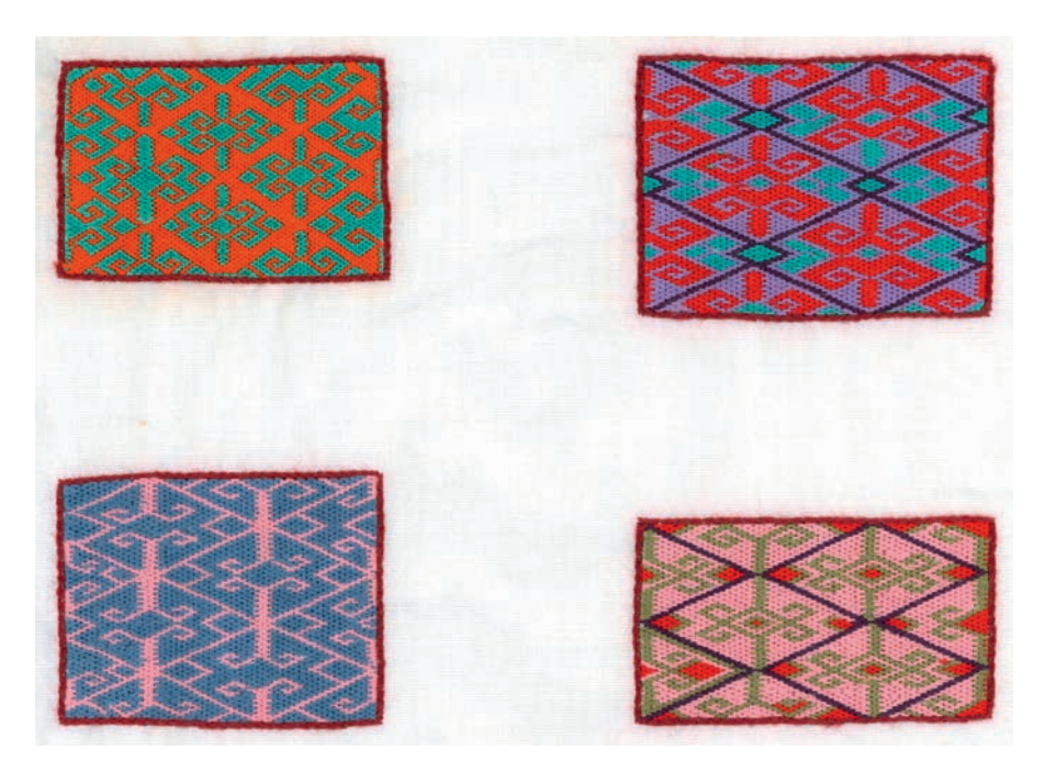
Figure 3. Hazara embroidery with silk thread by Golafrus from Shahrak in Afghanistan. Individual pieces are approximately 4 cm x 6 cm (1.5 in. x 2.5 in.) or 12.5 cm x 6.5 cm (5 in. x 2.6 in.)

They then return a few days later and complete the embroidery in Goldenberg's presence to prove that it is truly their own work. With the successful applicants, Goldenberg agrees to an official employment contract which highlights the need for high quality embroidery. Translators are, of course, present at all stages of this process and support Goldenberg. The number of squares a woman is contracted to deliver per quarter varies. Besides the quality of the work and its popularity on the European market, social factors are also considered. Women who have to support many children are allowed to deliver more squares than, for example, young unmarried girls. However, Goldenberg also always makes sure to employ a significant number of unmarried girls between the ages of 12 and 20, in an attempt to revive this dying craft. Currently, the project in Laghmani has contracts with about 200 women and a second programme founded in 2009 in Shahrak, in west Afghanistan near Herat, employs 30 women from the ethnic