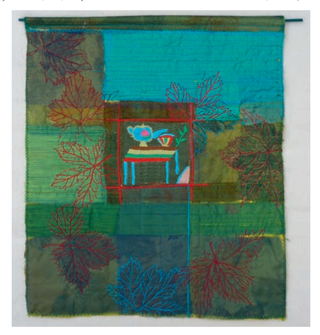
Figure 6. Liz Ashurst, UK, Tea in the Forest, 2007