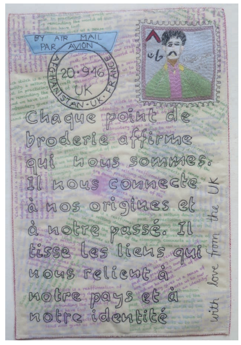
Figure 1. Gillian Travis, UK, Letter to my Friends , 2016, 29.7 cm x 42 cm (11.7 in. x 16.6 in.), screen-printing, embroidery and free-motion quilting (Credit: Gillian Travis)