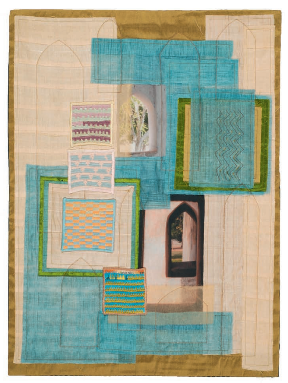
Figure 9. Molly Bullick, UK, Windows to the World, 60 cm x45 cm (24 in. x 17 in.) photo transfer, machine sewing and quilting