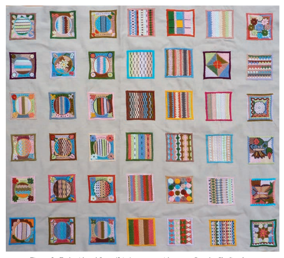
Figure 2. Embroidered 8 cm (3 in.) squares with cotton floss by Shafiqa from Laghmani in Afghanistan

other stitch types which are used in combination with the former. <sup>26</sup> The women were and continue to be at liberty regarding their choice of design. However, they have always been encouraged to take inspiration from traditional practices and to use more than one colour. Goldenberg only stipulates that the embroidery must fully cover an 8 cm (3 in) square and that the women use the materials provided (Figure 2). The embroideries are worked using Madeira cotton floss on background squares cut from used cotton or linen bed-sheets. Both floss and background are donations that are imported from Germany. The finished squares are collected quarterly and the women are paid for the previous delivery as they hand over the next one. With each collection, Goldenberg receives about 3500 to 4000 pieces of