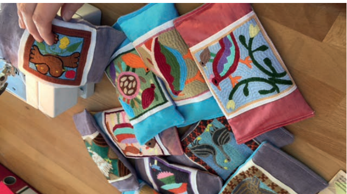
Figure 7. Sample works using embroidered Afghan squares: book covers by Sylvia Tischer from Germany (top), small pillows by Julie Herberger-Dittrich from Germany