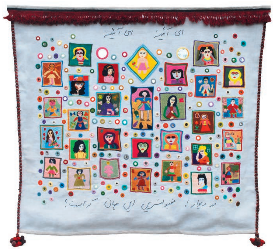
Figure 12. This wall hanging by Hella Prinzhausen from Germany features some of the very first (self-) portraits stitched by the Afghan embroiderers. Cotton, mixed media and embroidery

encouraged by Goldenberg and her colleagues (Figure 12). According to Parker: