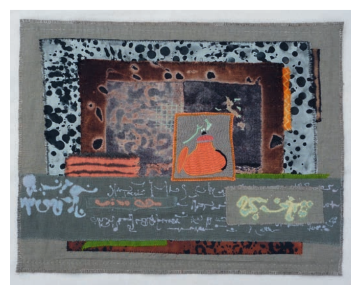
Figure 5. Molly Bullick, UK, Ways to Communicate-Voices on the Road, 2007