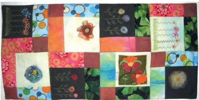
Figure 8. Sample works using embroidered Afghan squares: bag by Anne Bouissiere from France (top) and small patchwork wall hanging by Heidrun Siegler from Germany