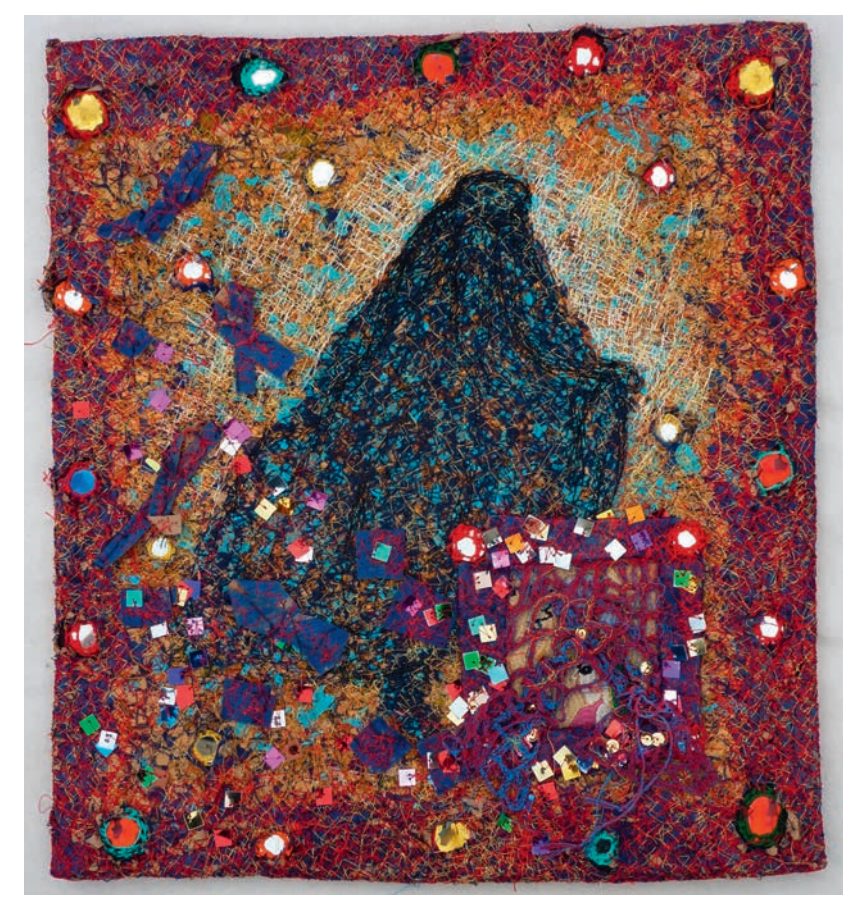
Figure 11. Yumiko Reynolds, UK, Hidden Beauties, 2007

quilt group's 'show and tell' to likewise engage with the cultural context in which the piece was conceived.